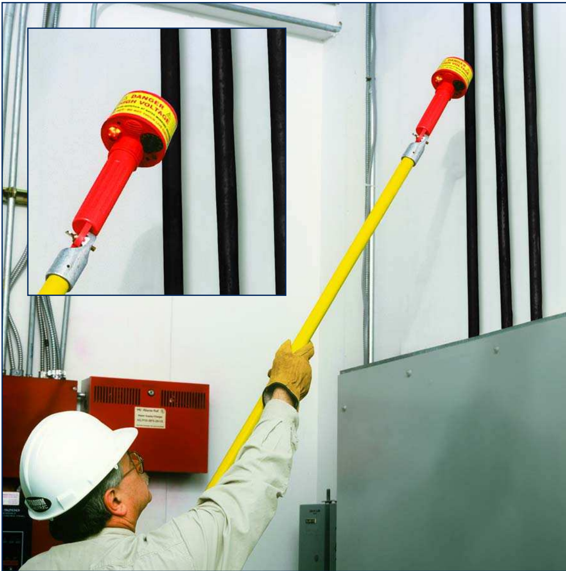
Model 275HVD checking for live voltage on main feeder