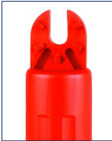
Universal spline for hot stick connection