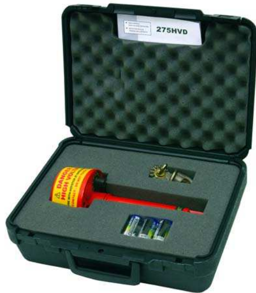
Model 275HVD includes three C cell batteries, a hard carrying case and user manual