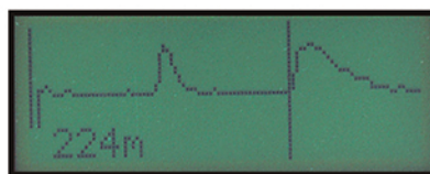
Graphical display of cable faults with digital indication of distance