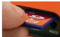
SD memory card included

Transfer data from meter to PC using Excel® software and datalogged readings from the SD memory card (included)