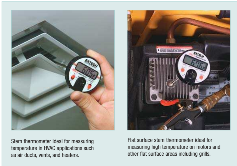
Stem thermometer ideal for measuring temperature in HVAC applications such as air ducts, vents, and heaters.