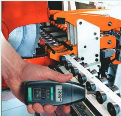
Accessory wheels enable tachometer to measure linear speed surfaces