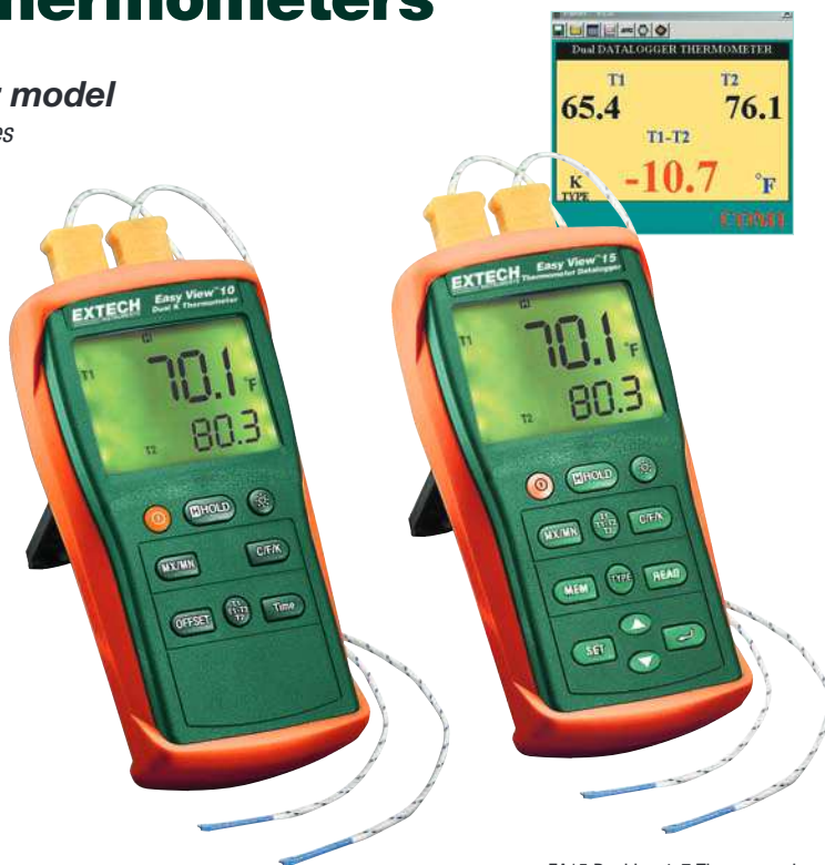
EA10 Type K Dual Input Thermometer