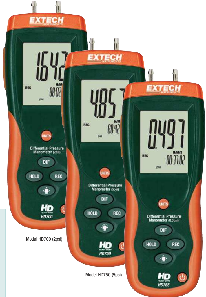
Model HD700 (2psi)