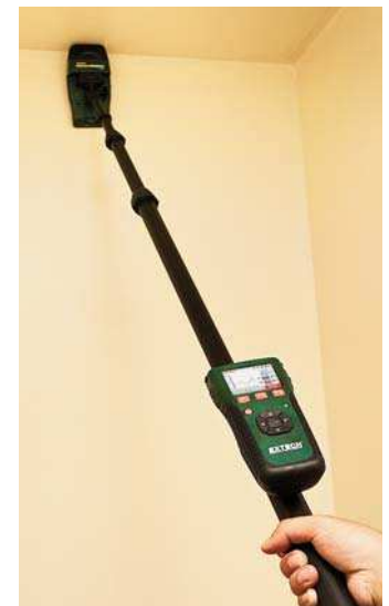
Wireless sensor affixes to telescoping handle