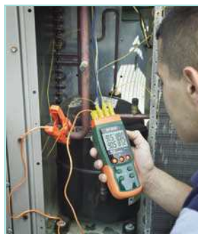
Simultaneously measures 4 temperature inputs for multiple source monitoring