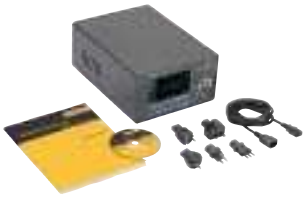
Fluke Norma 4000 Basic Configuration