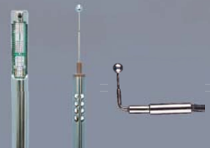
Expanded Seven Air Velocity Probe Line-up