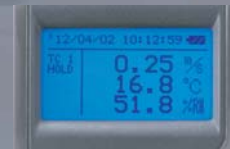
LCD display with bright backlight