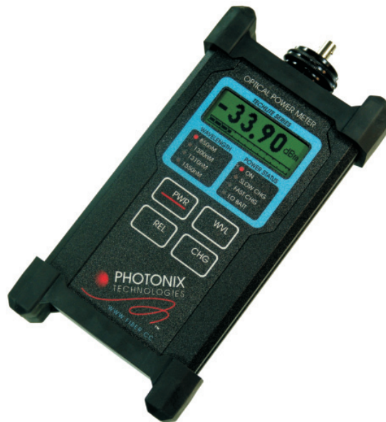
Note: Photos may vary from actual product