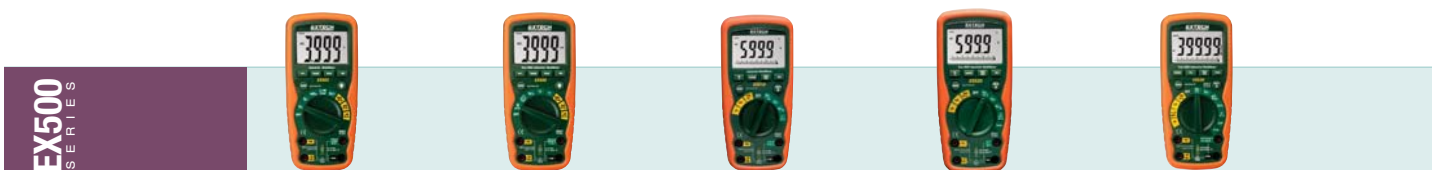
Drop-proof to 6 feet (2.9m)