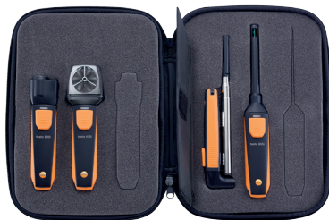
VAC Smart Probe Kit: 0563 0003