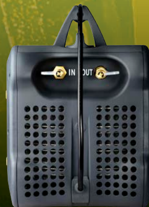
Easy access ports for one-handed operation