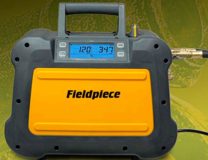
Bright digital display with status codes