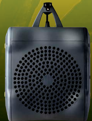
3,000 RPMs for faster recovery